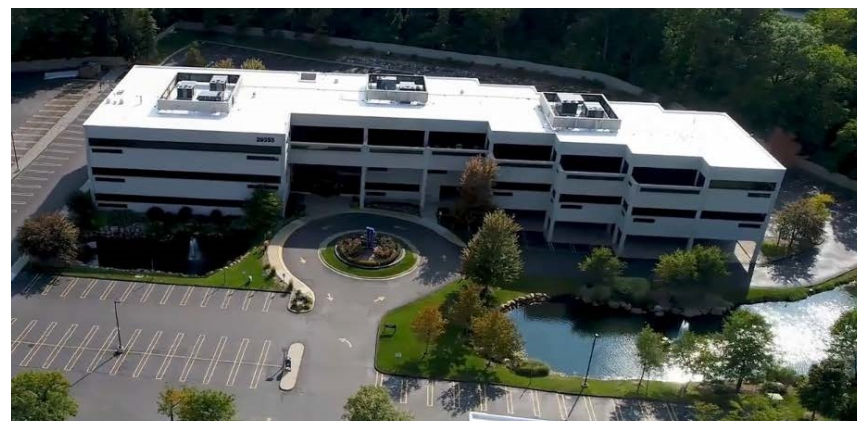
29355 Northwestern Hwy. (Ari-El Enterprises, Inc. corporate headquarters) Southfield, MI

Today, the company is aggressively seeking opportunities to expand its portfolio through the acquisition of new investments. Above all, Ari-El Enterprises is committed to well-paced, controlled growth which yields long-term benefits for valued tenants and joint venture partners.