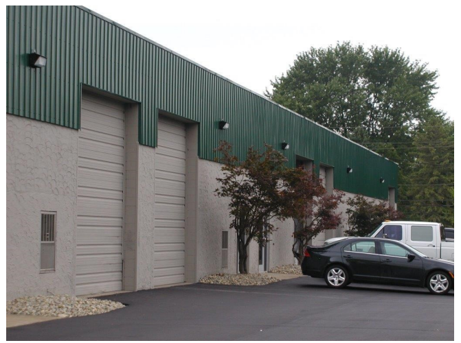
General Court Commerce Center Plymouth, MI