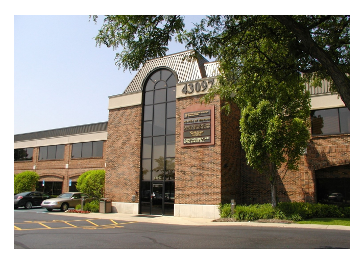
Phase II Completion of Kingswood Office Building