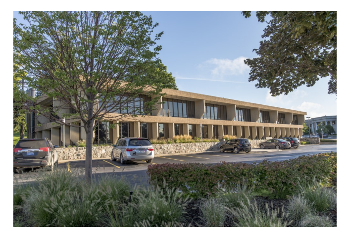
74 W. Long Lake Office Building Bloomfield Hills, MI