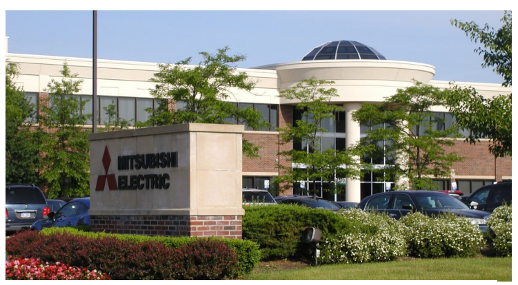
Mitsubishi Electric Automotive in Centennial Business Park Northville, MI