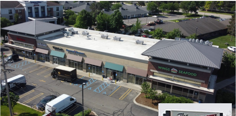
Northwestern Highway Plaza Redevelopment of Kabobgy Restaurant site Southfield, MI