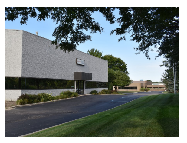
42960-70 W. 10 Mile Road (duplex) Novi, MI

Ari-El Enterprises consistently applies a highly effective team approach to maximize returns. This synergy facilitates the creation of new paradigms which enables the company to anticipate potential, then develop and implement innovative solutions.