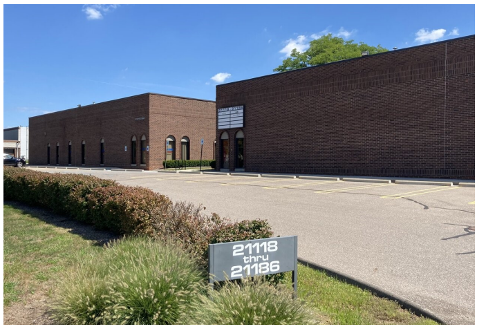
Bridge Commerce Center 1 Southfield, MI