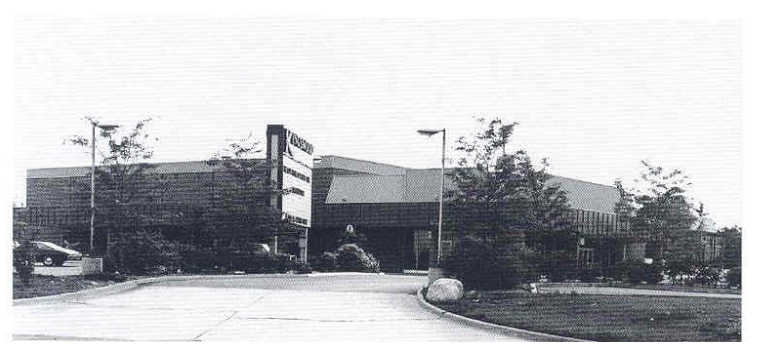
Kingswood Plaza at Acquisition