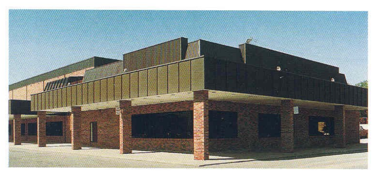
Phase I in Progress