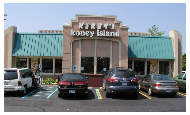
Kerby's Koney Island is part of Kingswood Square Plaza Bloomfield Hills, MI