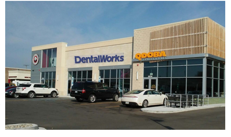
ARI-EL ENTERPRISES, INC.

Real Estate & Development Services Licensed in the State of Michigan