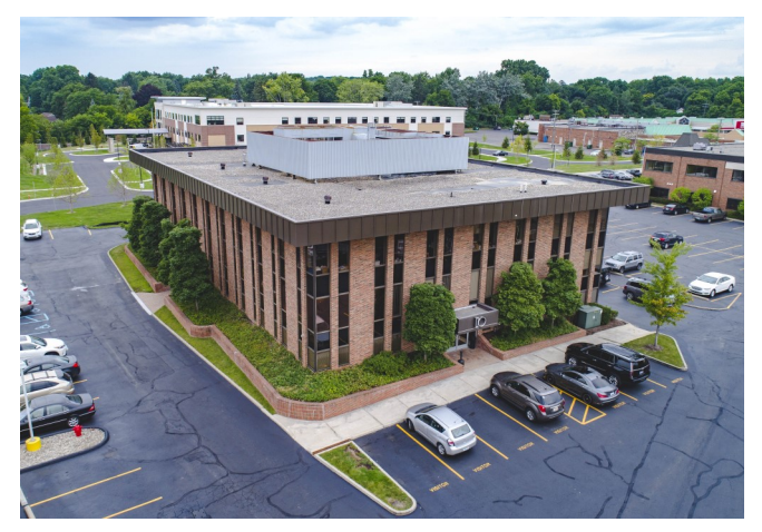
10 West Square Lake Office Building Bloomfield Hills, MI