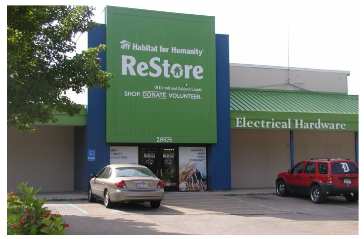
Habitat for Humanity of Oakland County - ReStore 28575 Grand River Avenue Farmington Hills, MI