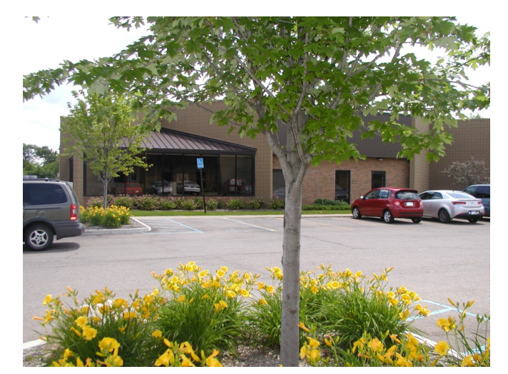
Galloway Light Industrial Development Auburn Hills, MI

The acquisition of a substantial real estate portfolio is a prolonged and challenging undertaking. Making the assets work is just as challenging, and certainly deserves no less planning. Ari-El Enterprises' Asset Management Team is focused on determining exactly how the company's current holdings can be used most efficiently in view of current and projected real estate trends. It is the formulation of a workable and realistic strategy for achieving goals over an extended time period. In every case, the goal is to achieve maximum capital appreciation in the shortest period of time, while ensuring long-term investment value.