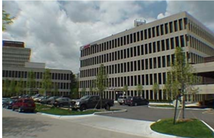
19855 West Outer Drive