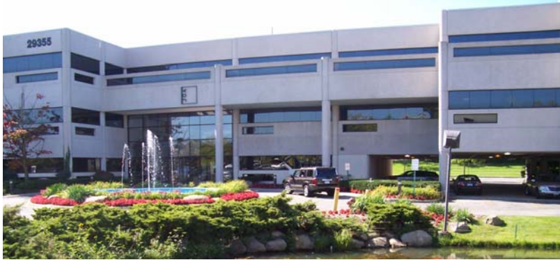
29355 Northwestern Highway North of 12 Mile Road