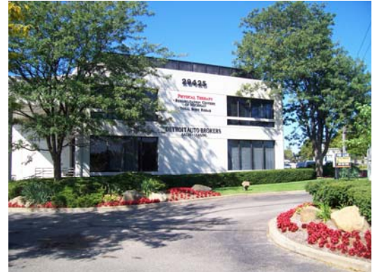
29425 Northwestern Highway North of 12 Mile Road