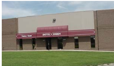
Farmington Hills Industrial Center Farmington Hills