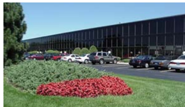
Grand Rapids Corporate Center Grand Rapids