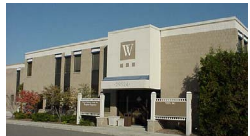
Woodfield Office Park Southfield