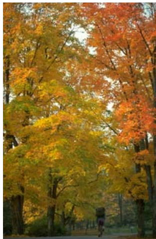
Wonderful Michigan Fall Col-

Enjoy the fall colors & winter activities of Michigan!