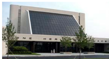
One Heritage Place Southgate