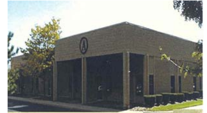
Jeffries Tech Center Livonia