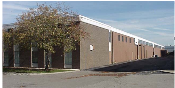
Southwest corner of building