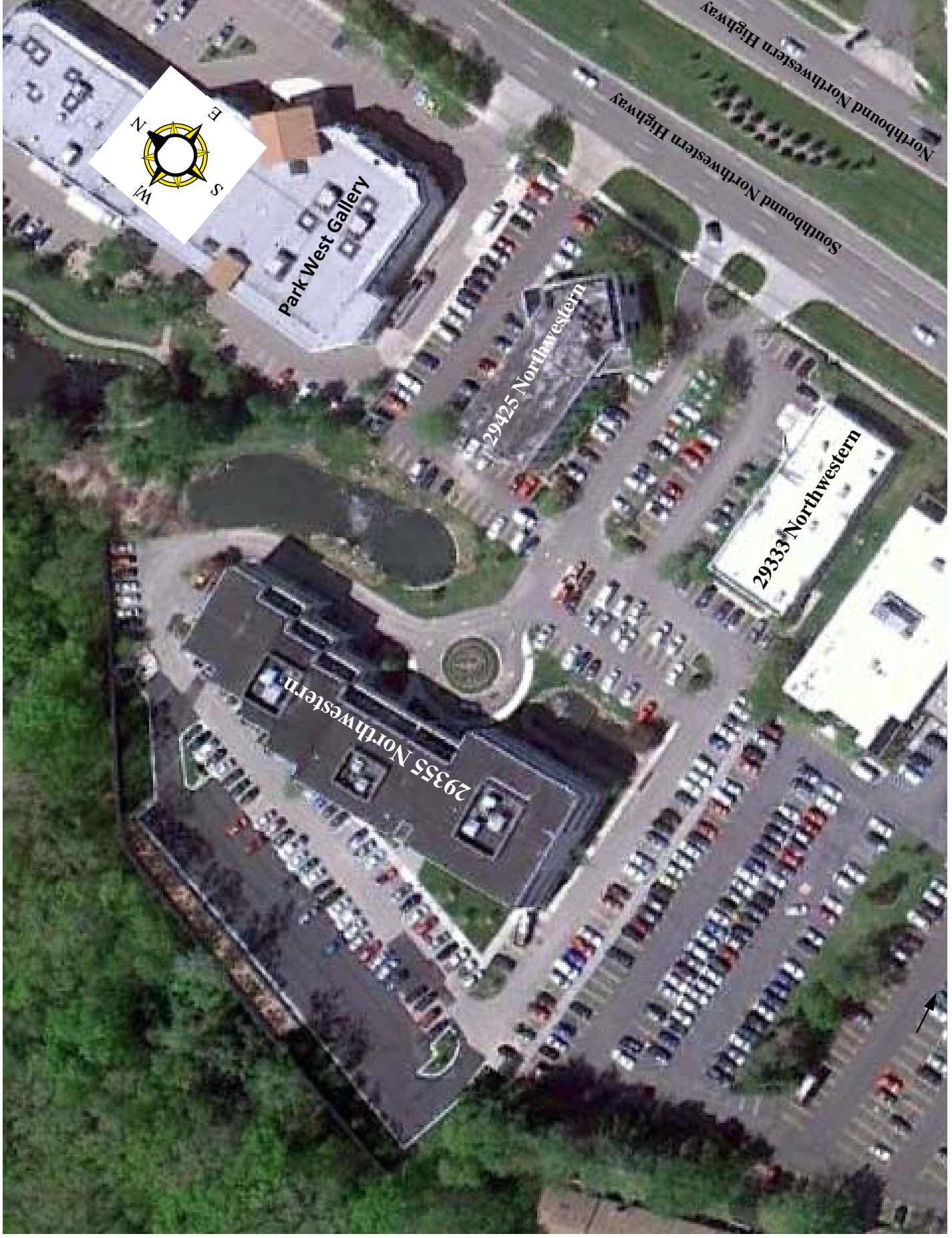
29355 Northwestern Hwy. (formerly known as Carson Office Center)